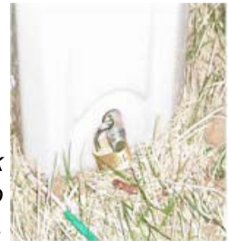
Anti-theft lock secures sign to base (right).